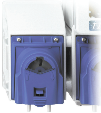
Sanitizer & Rinse Module 81-118-18

Dema's sanitizer and rinse module is an easy to add 3rd pump for any 2 product liquid / liquid or dry / liquid system. The 3rd pump easily integrates into the 2 product design for an attractive 3 product system. The pump module comes complete with everything needed for a quick installation.